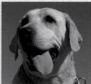
NAME: BAILEY CHARGED WITH: SHOPLIFTING