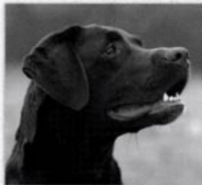
NAME: CASH CHARGED WITH: VOYEURISM

The lovable Lab turns delinquent in this waggish romp. Soft eyes and a sweet disposition can't erase the antics of these lawless Labs, whose violations include disorderly conduct, breaking and entering, fleeing the scene of an accident, and indecent exposure. Whether yellow, black, or chocolate, their transgressions cross all social, political, and economic lines. Having read these rap sheets, you'll never look at the twinkle in a Lab's mischievous eyes the same way again.