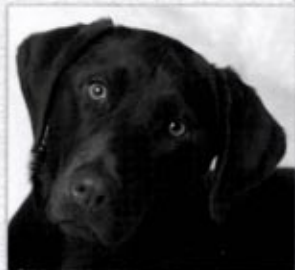
NAME: KERMIT CHARGED WITH: PUBLIC NUISANCE